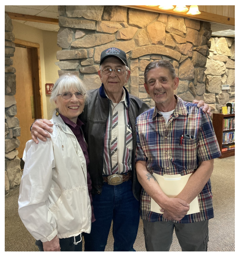
AMATEUR RADIO LICENSE EXAM SESSION